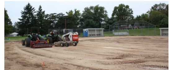
NESD Baseball Infield

TTC has assisted NESD with the analysis, design, construction documentation and administration for the renovation to the district varsity baseball field. Deemed unsafe for play by the district, the field was removed from play in 2012. Reconstruction is 95% complete, and the field is expected to resume service in 2014 after it grows in.